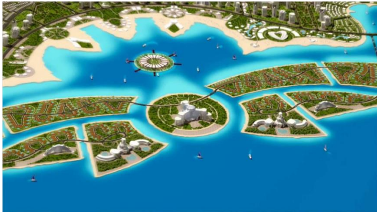
Fig 2: Potential design of the new Port Said city